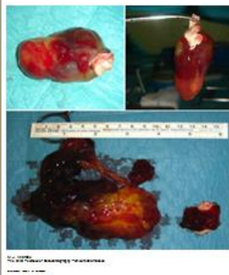
Figure 20.1 Left atrial myxomas that were removed surgically. Note the difference in appearance: the top myxoma has a smooth surface while the bottom one is villous, more friable, and prone to tissue fragmentation and embolism.